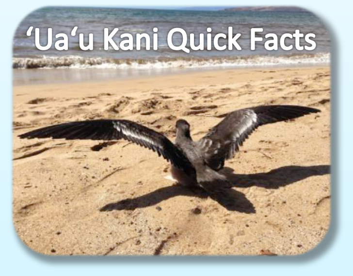
Wedge-tailed shearwater Scientific name: Ardenna pacifica

Protected under the Migratory Bird Treaty Act