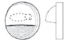
'Eyelid' Step Light