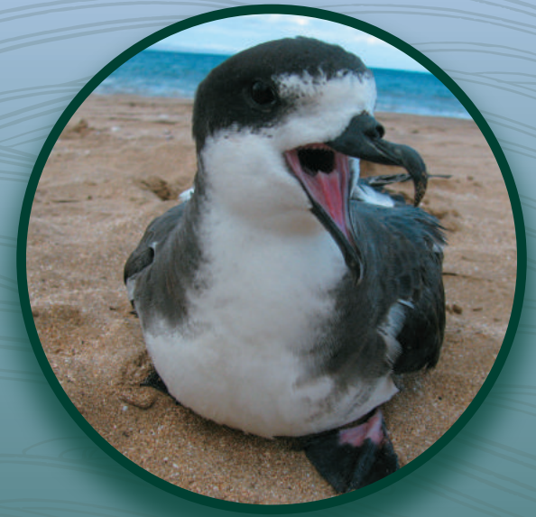
'Ua'u Hawaiian Petrel